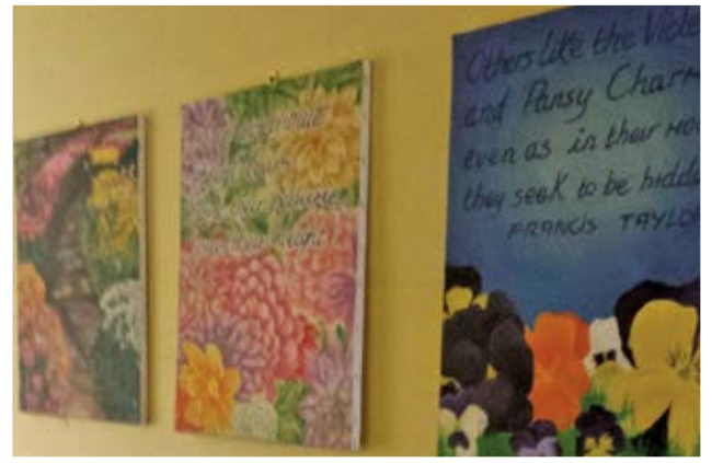
Art display for our 75th Anniversary 2015

All First Years participated in a basketball event to raise funds for Our Lady's Children's Hospital Crumlin. Fourth Year students assisted in many ways on the day. Well done to all staff and students involved. The amount raised was a spectacular €2405.