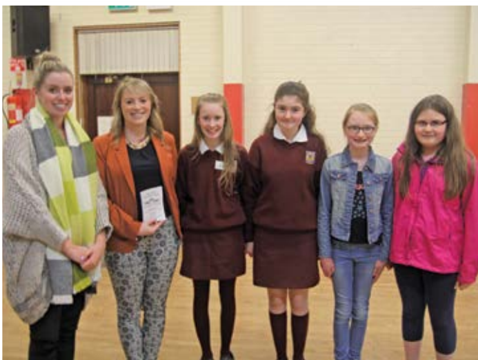
Open Night 2015