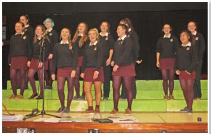
Leaving Cert choir sing at Open Night