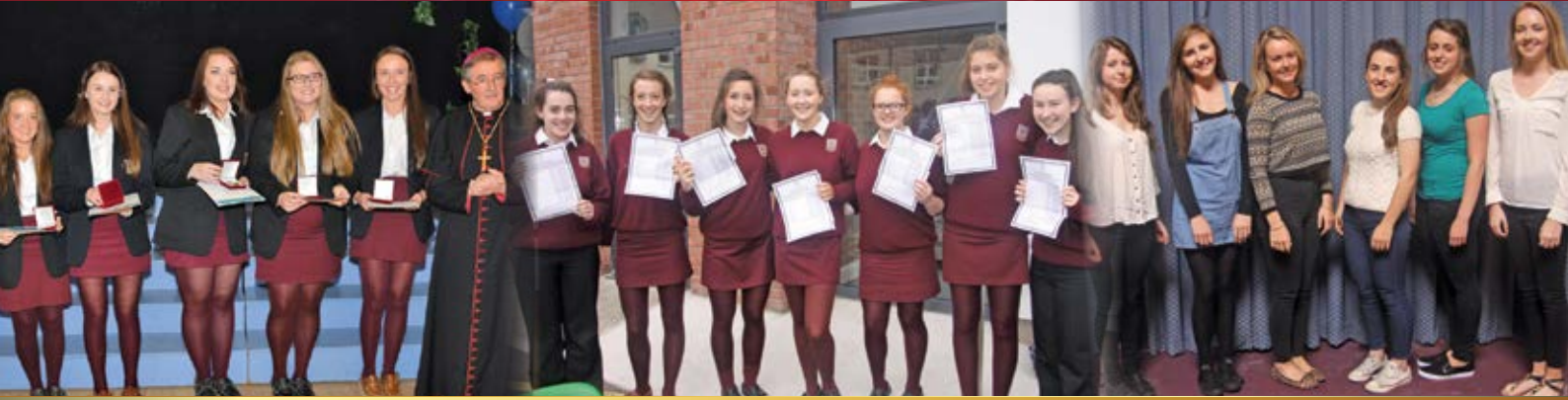
Cloyne Diocesan Pope John Paul II Youth Awards