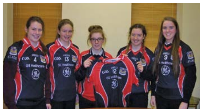
New Jerseys thanks to GE Healthcare and Parents' Association