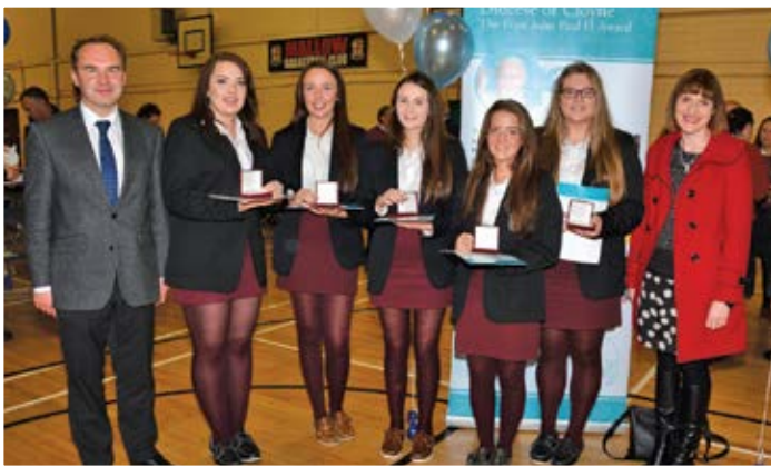
Pope John Paul II award winners