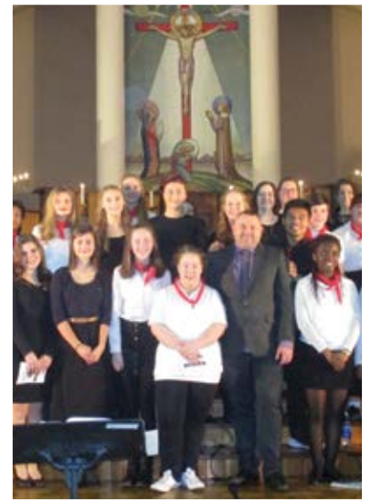
Students from St. Aloysius' College among the participants at the Songs of Faith concert.

Church on Tuesday December 15th. Our annual fundraising collection for our Lifelinks Kenya education development fund and our local society of St. Vincent de Paul was held. The Music Department and LCVP Department had a wonderful fundraising event on October 23rd for the Neo-Natal Unit in CUMH. On Sunday December 20th carol singing was held in Market Green Shopping Centre between 2pm and 4pm. Transition Years are busily preparing for their production of "Beauty and the Beast" which will run in the College Hall as two matinees at 12pm and 3pm on Sunday January 31st and from February 1st to 4th at 7.30pm each night.