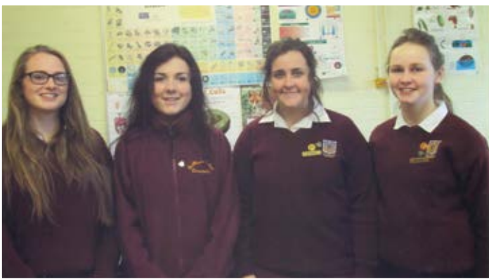
Meitheal Team 2015/16