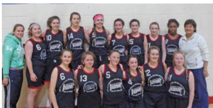
U16A County Champions

Well done to the four cadette and senior basketball teams on a very successful year to date. The U16 A team won the County Championship beating Presentation Bandon. The U19A and U19B teams both made County Finals and received silver medals. The U16 and U19A teams have