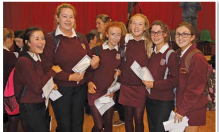
Junior Certificate students celebrate

In the Junior Certificate all students did brilliantly with a large number of A grades in all subject areas across the board. Congratulations to all the girls.