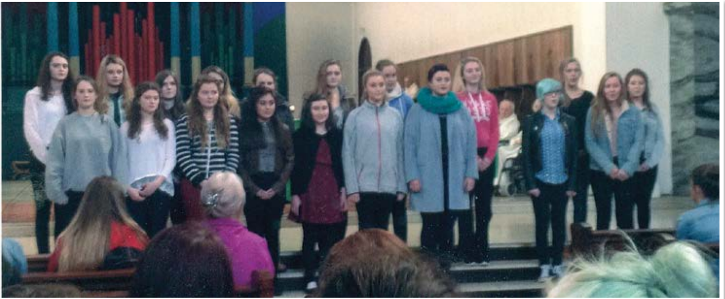
Leaving Cert Choir sing at Glenstal Abbey