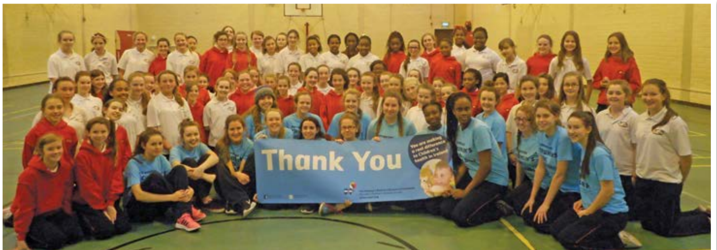
Participants in Jump for Joy