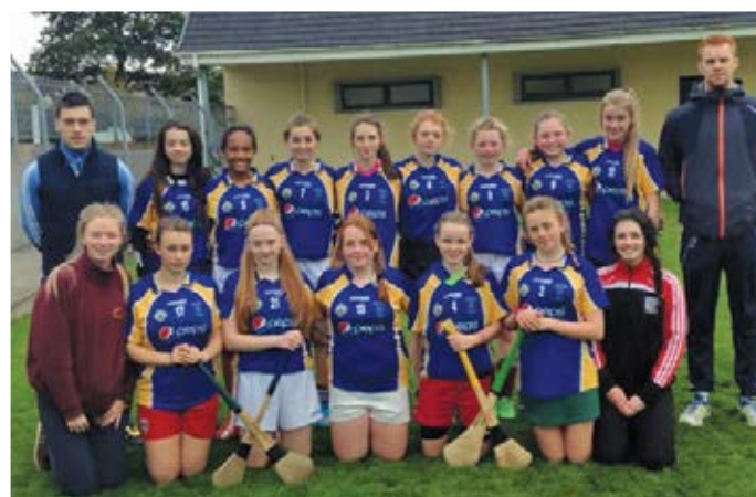
First Year Camogie Blitz Winners