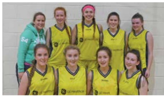
U19A County Finalists

reached All-Ireland Cup Semi-Finals beating teams from Cork, Dingle and Westmeath thus far.